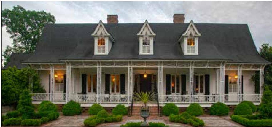
The Sullivan House was built in Anderson in 1859, and was moved to an area just outside of Greenwood, called Friendfield, in 1997.

It is now an elegant trifecta of architecture, history and gardens in a private pastoral setting. Everything about this property is unique. It was built by a Charleston family in 1859 as a summer home but probably never used due to the outbreak of the Civil War. It features distinctive architecture referred to as Chinese Chippendale, so